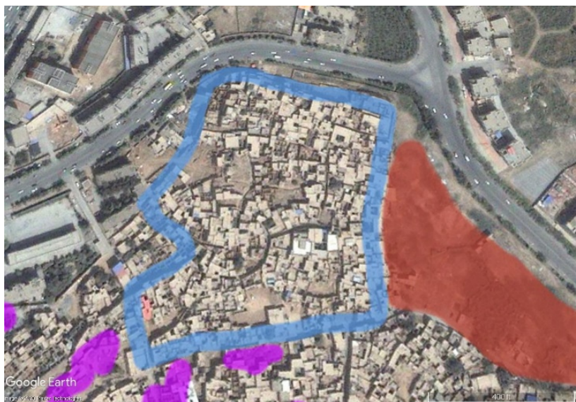
Left: 3/6/2005 | Right: 8/21/2012 (Google Earth).