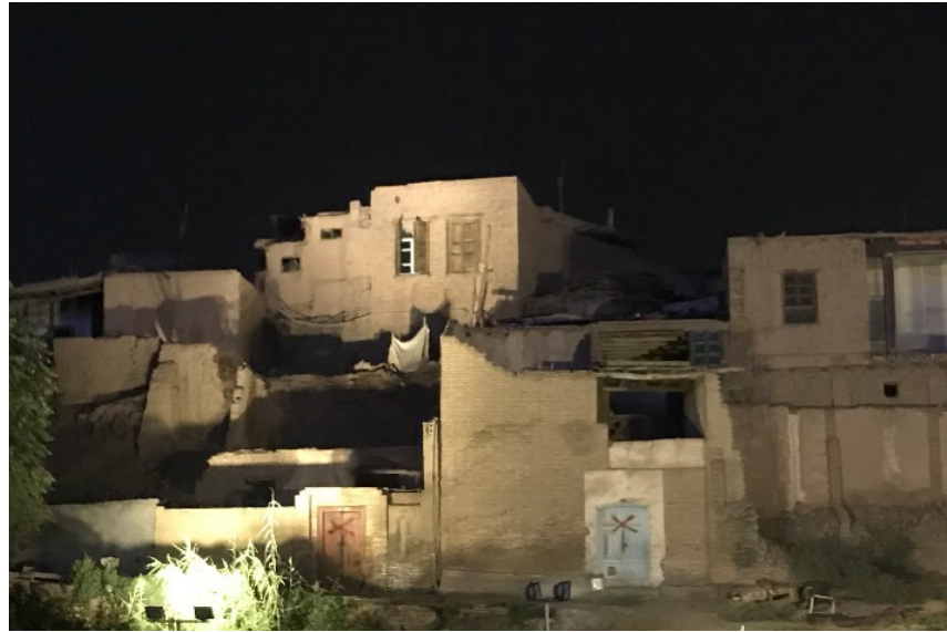
Night shots of Kozichi Yarbeshi abandoned, with dilapidated houses, electrical boxes removed, padlocks, and X's on doors. Photo by author, October 2018.

Recent photos by one tour guide from the region confirm the presence of heavy demolition machinery near the neighborhood: