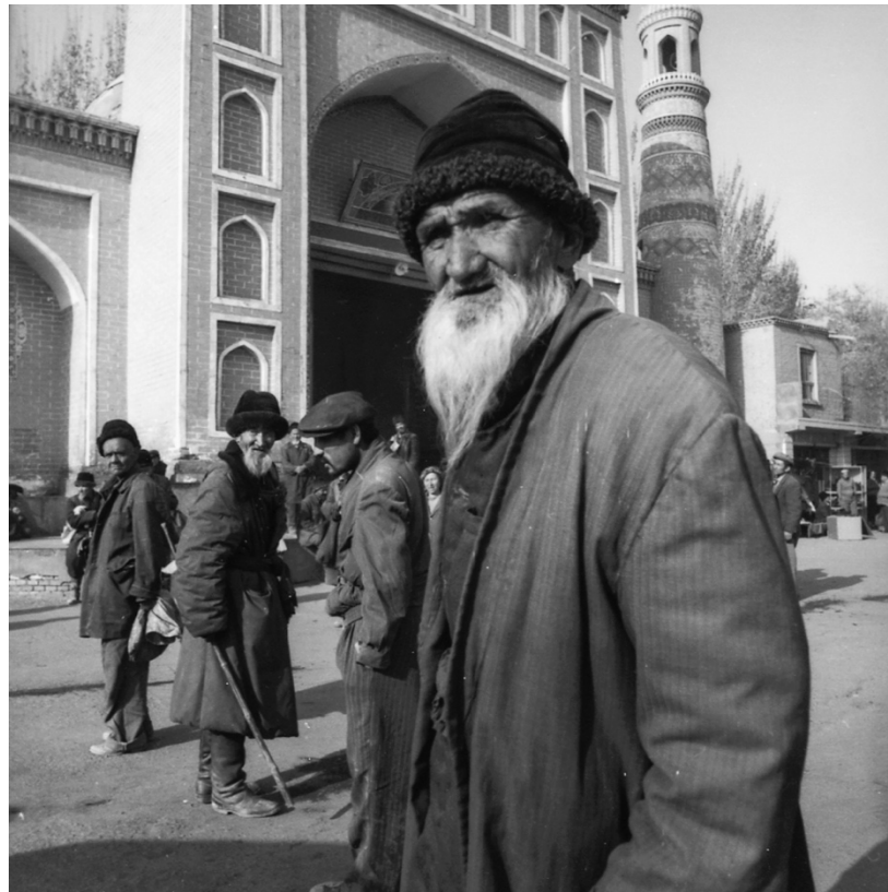
Kashgaris leaving Id Kah Mosque, 1998. © Kevin Bubriski (not affiliated with UHRP).