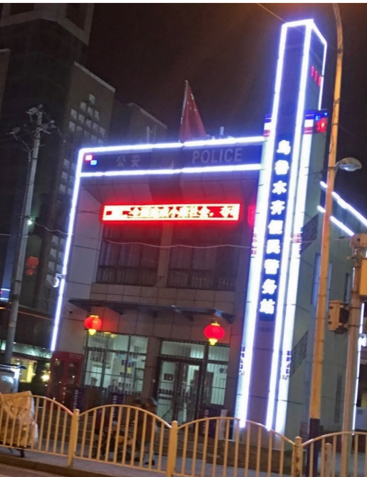
Typical “Convenience Police Station” in Urumchi.

Rather than neighborhoods radiating out from organically dispersed mosques, Kashgar’s neighborhoods now radiate out from systematically planned “convenience police stations,” parts of the “grid-management system” that divides each city into squares of 500 people to be monitored by these hubs of surveillance and social control. 72 In this sense, the new network of police stations replace the old mosques both geographically and functionally as spatial