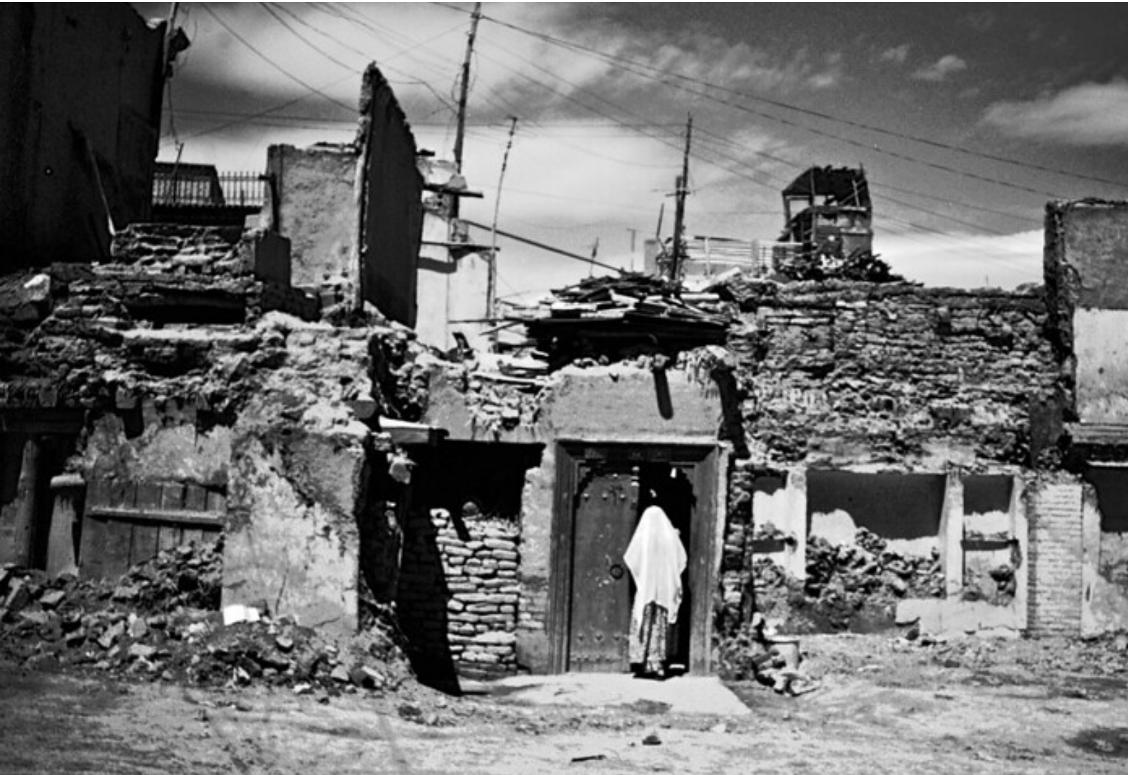
Woman entering Old City Ruins, July 30, 2012.