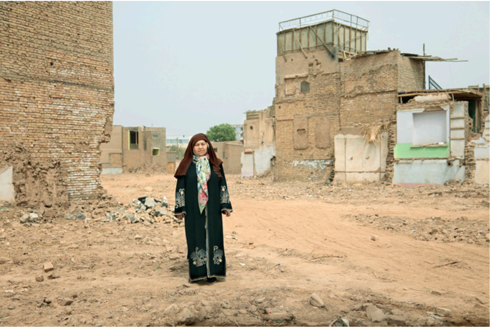
Kashgari woman standing on the site of her former home, August 2011.