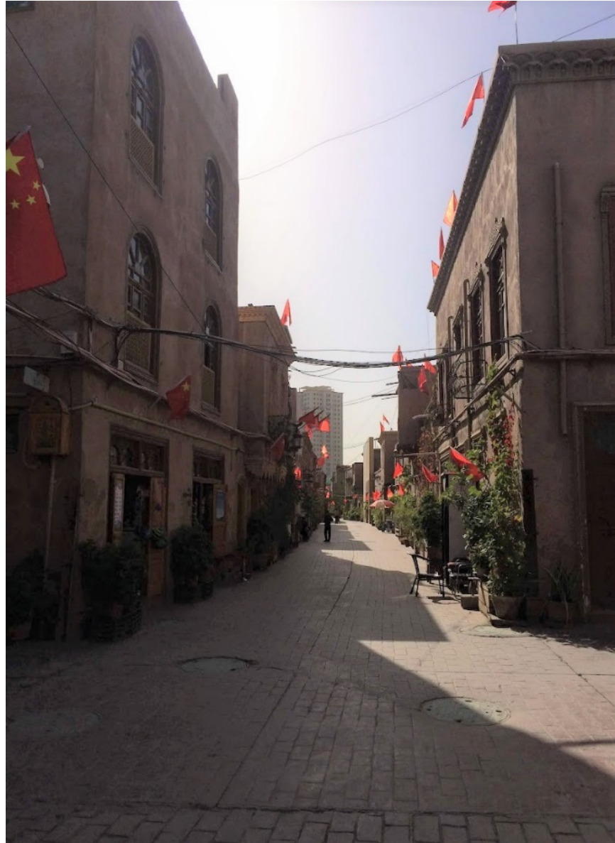
'Islamic Lego' style architecture post-reconstruction, widened and squared streets with Chinese flags.

buildings, more of which will probably fill the huge area—around ten city blocks—that have been cleared at the foot of the hill. It was strange to see such a vast open space in the heart of a city; it was as if there'd been some kind of disaster. . . .