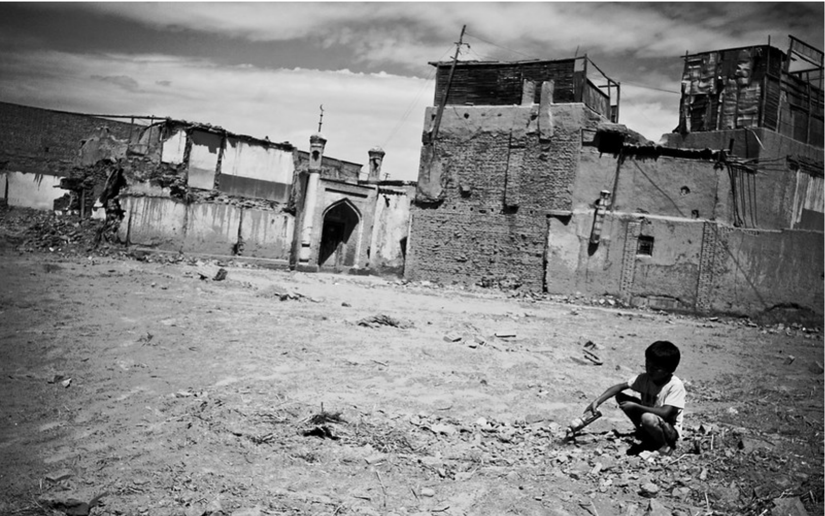
Child playing in ruins of Old City, July 30, 2012. © Brett Elmer (not affiliated with UHRP).

Where satellite data gives some loose indication of the breadth of demolitions, on-the-ground photos can give a clearer view of the nature of the destruction: