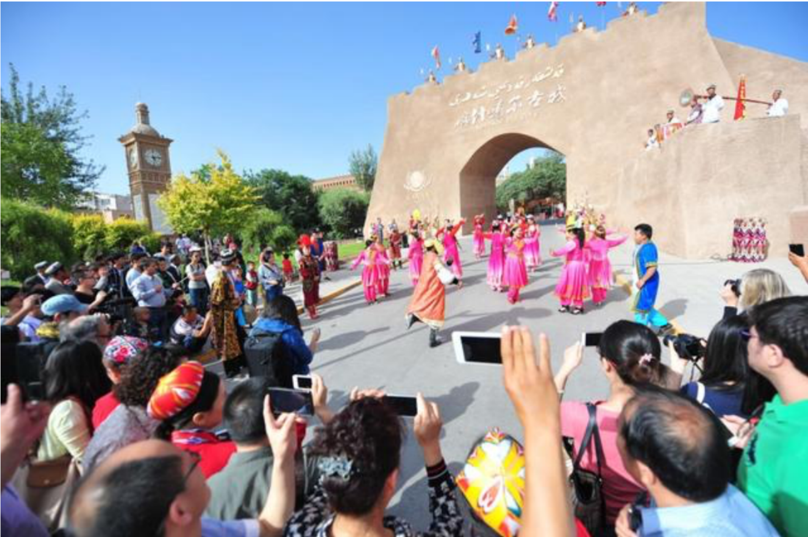
A commercialized traditional dance periodically performed for tourists outside of the Old City's (reconstructed) main gate.

Outside of the Old City, the broader economic transformation of Kashgar continued and accelerated. In May 2010, Kashgar was designated a new special economic zone, and paired with Shenzhen, the fishing village turned high-tech metropolis as a development partner. 104 In a bid to attract capital and settlers to Kashgar, the Chinese central government afforded the city a slew of tax breaks, investment incentives, and lighter regulations to start new businesses. Shenzhen contributed USD$1.5 billion in the program's first year to support the project, as Kashgar radically expanded its industrial parks, including a