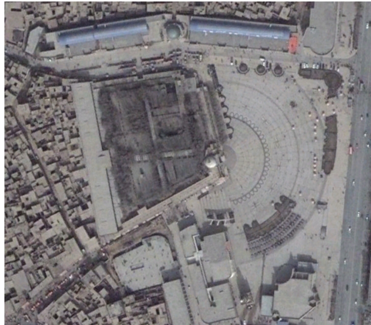
Id Kah Square, 3/6/2005, showing new shopping complexes to the north and south of the square, and rose garden removed.

far as 2002, meaning that satellite evidence of much of the initial market