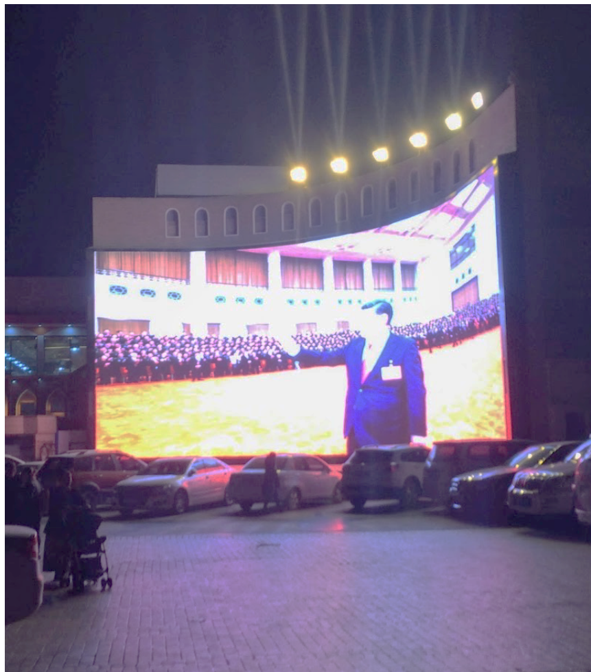
Giant LED scrolling through images of Xi Jinping at Id Kah Square. Author’s photo, October 2018.