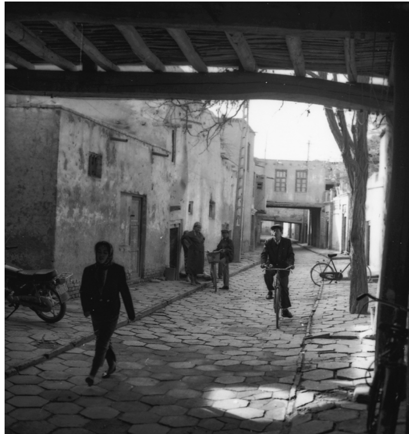
Kashgar, 1998.