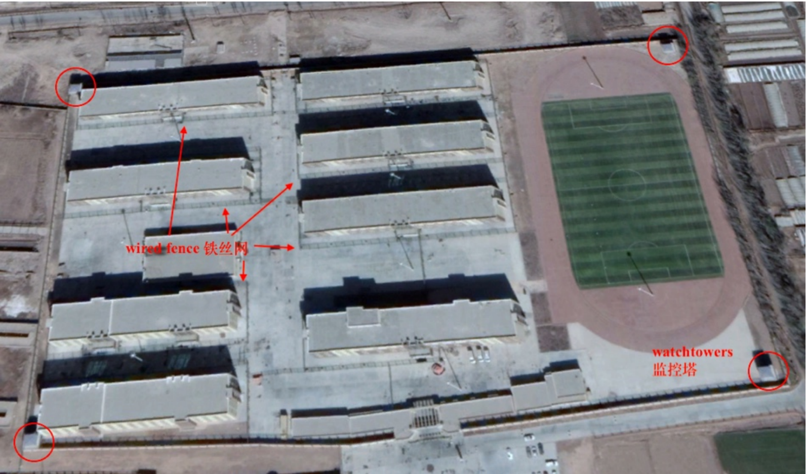
Satellite Imagery of Xinjiang “Re-education Camp” №2 新疆再教育集中营卫星图. © Shawn Zhang.

The external appearance of the camp can be seen depicting watchtowers, barbed wire, and bars over windows (p.34).