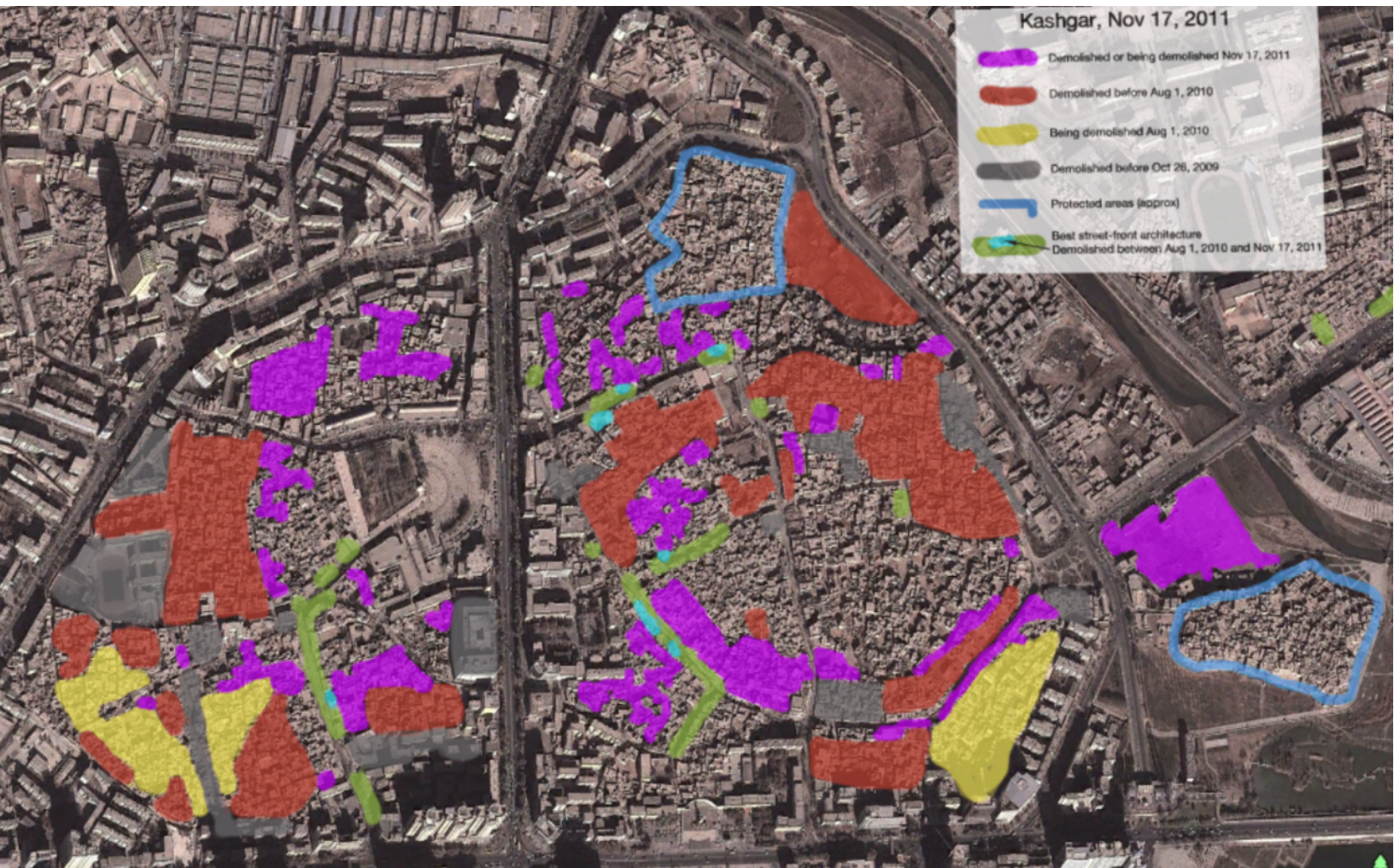
Mapping the time/area of Kashgar reconstructions through Nov. 17, 2011. © Stefan Geens (not affiliated with UHRP).

Geens's work has been extremely helpful in showing how reconstruction progressed over time. However, much of the reconstruction occurred after his documentation ended, further enveloping the city in more new architecture. Although much of said