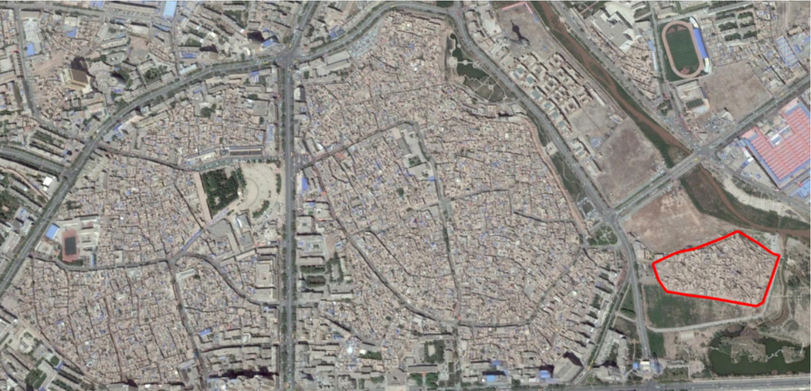
Kashgar's Old City, Kozichi Yarbeshi / Gaotai Minju, outlined in red.

representations of community order: the former according to principles of community religion and tradition, the latter around principles of state coercion and compliance. A similar displacement and reordering are also mirrored in the symbolic community heart of Uyghur culture, Id Kah Square. Opposite the centuries-old face of the iconic mosque is a towering LED screen scrolling through gigantic images of Xi Jinping.