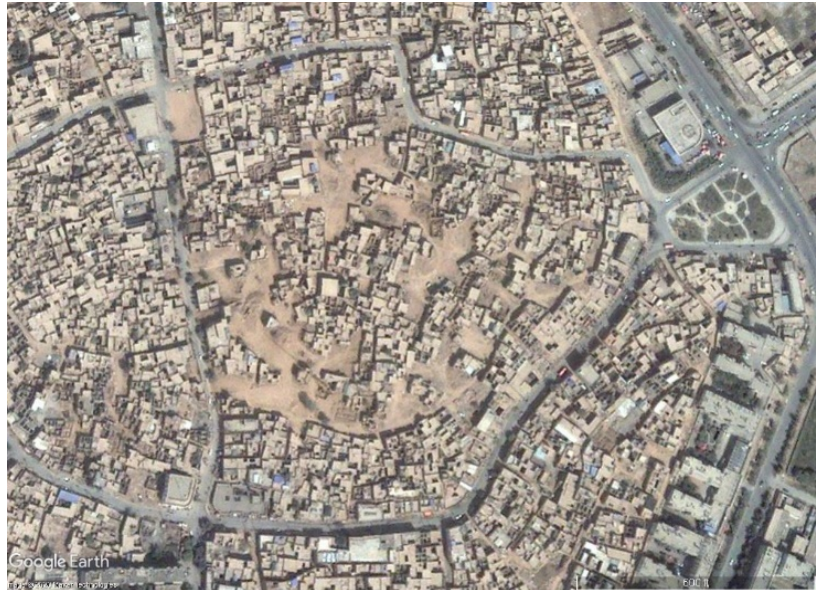
Left: 10/25/2009, right: 8/21/2012.

Notice also that even one of the two areas listed as “protected” in 2011 experienced significant reconstruction in 2012—again, likely including much more than is clearly depicted by the satellite data: