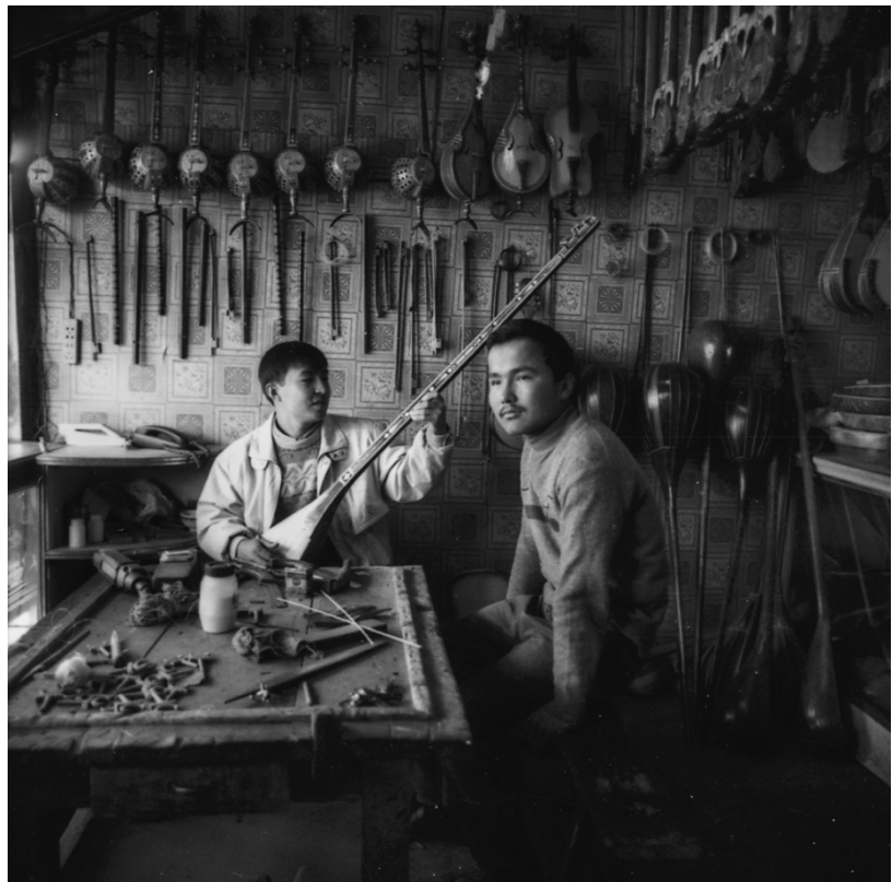
Traditional Uyghur instruments and wooden store front in 1998 Kashgar. © Kevin Bubriski (not affiliated with UHRP).