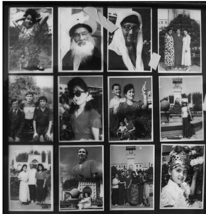
A wooden stall of the type that used to be seen in Id Kah Square; tourist photos in front of the old rose garden.