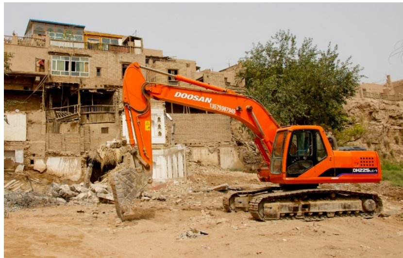
Historic neighborhood at risk.

The neighborhood in question was famous for housing stalwarts of Uyghur culture who resisted Old City reconstruction with notable fervor. While getting any reliable information out of Kashgar is a