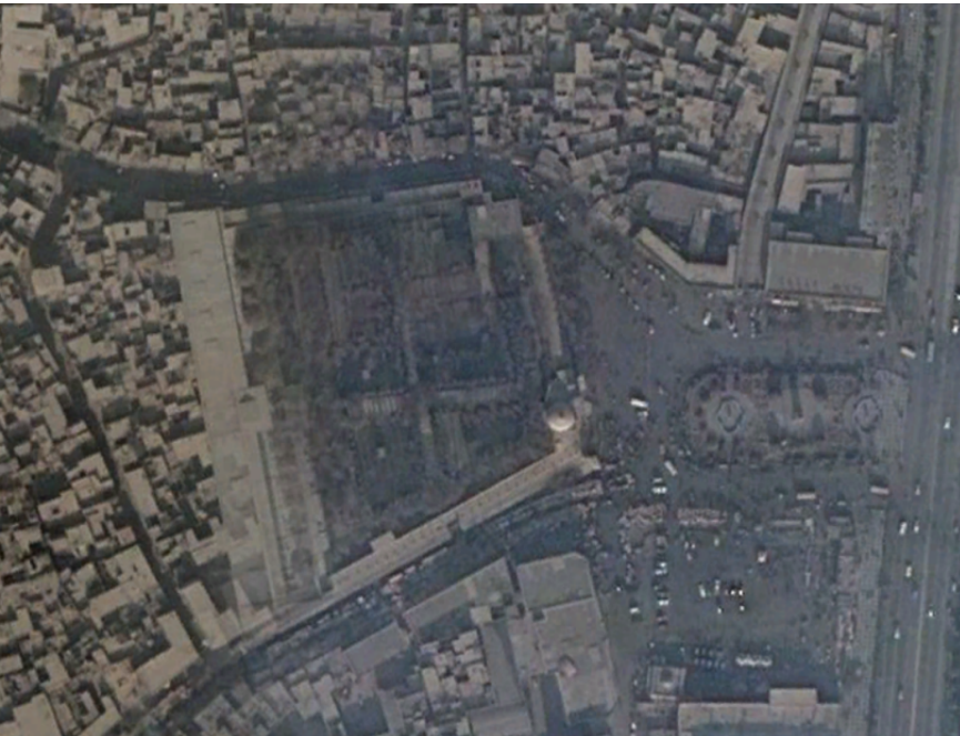
Id Kah Square, 12/1/2002, depicting oval rose garden east of the mosque, and houses north and south of the mosque later removed.