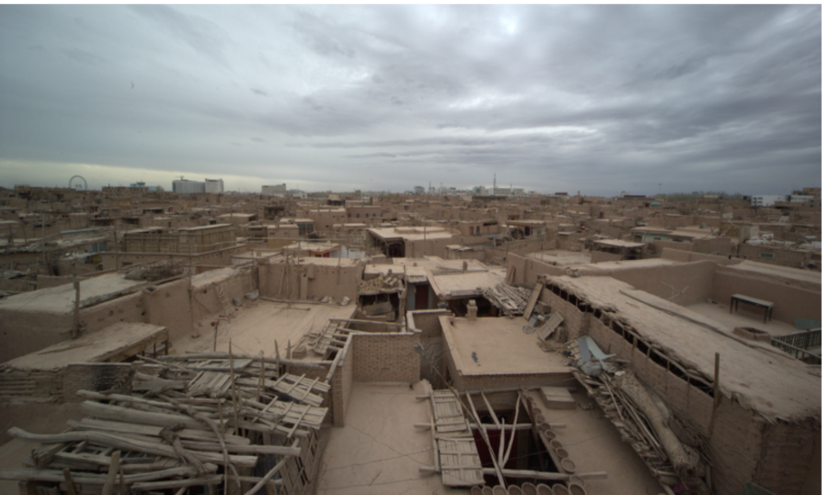
Interconnected rooftops of the Old City, 2005; Gollings, John. “Kashgar Old City”. Figshare, September 23, 2016.

Moving beyond the complexity and interwoven-ness of the Old City as a whole, we can consider the construction features of the houses themselves, dense with social meaning and cultural praxis. We first consider the locations of the houses in proximity to the city’s mosques. As Liu and Yuan have plotted, the Old City was speckled by 112 fairly evenly dispersed mosques, each of which would serve 10–25 households within a radius of 50–100 meters, 15 creating an ecosystem of embedded religious practice within the community.