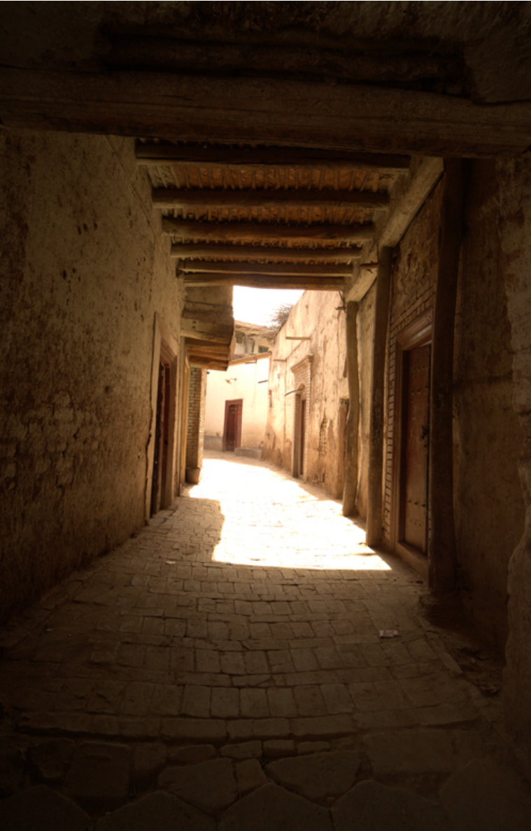
Labyrinthine mudbrick alley, pre-reconstruction, 2005